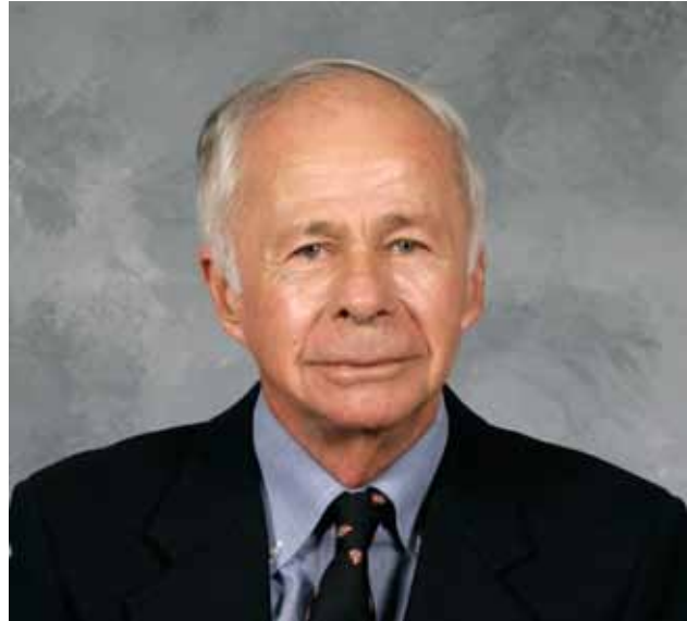
Gene Dirk's Hall of Fame Portrait

Like the radar-scope films, extracting cine data from the film was again tedious and time consuming. With Dirk's proposals, film reading speeds jumped dramatically. It was